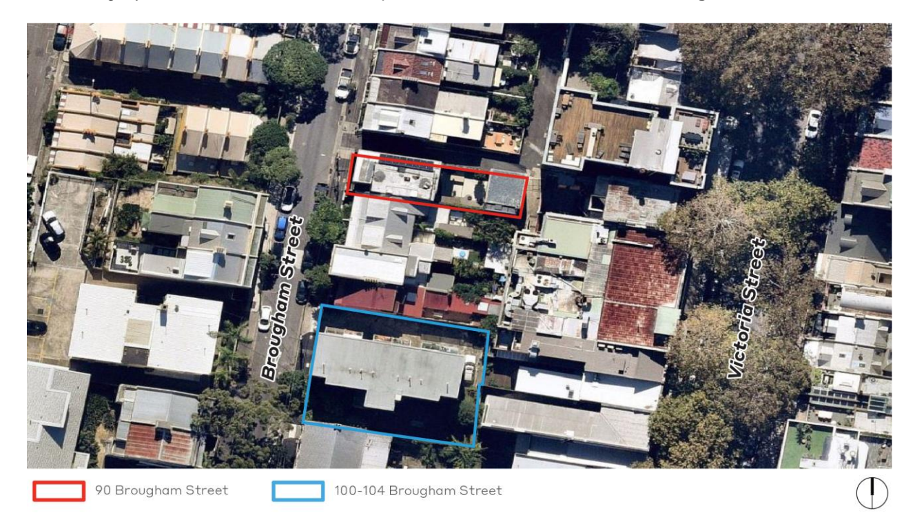
Figure 1Aerial Photograph

90 Brougham Street, Potts Point is legally defined as Lot 15 Section 4 DP 28 and 100-104 Brougham Street, Potts Point is legally defined as SP 1560. An aerial photo of the sites is made available in Figure 1 .