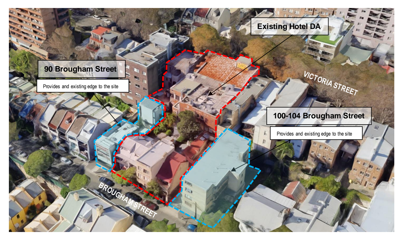
Figure 3 Perspective – looking generally north east